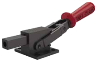
5150/5150-M Flanged Base