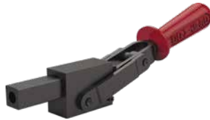
5150-B/5150-MB Solid Base