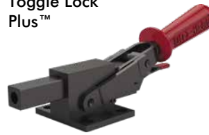
5150-R/5150-MR Flanged Base with DESTACO® Toggle Lock Plus™