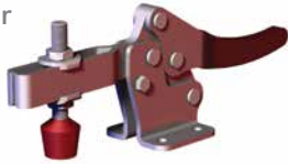
245-U Flanged Base U-Bar