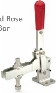
229 Flanged Base Open Bar